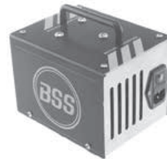
BSS GAST Vacuum Pump Part No. 4527

BSS GAST Vacuum Pump ..... Part No. 4527 ..... $199.99