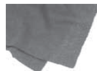
Knit CarbonX Fabric Part No. CarbonX-278