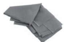
Woven Nomex® Fabric Part No. 2134-Black