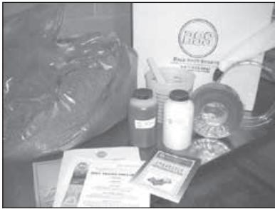
Creafom Bead Seat Kit Part No. 4525-Size Includes instructions, bag with Creafom beads, resin, gaffer's tape, and more!