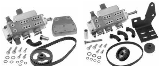
TDC / Fast Forward Dry Sump Pump Kit for 2.0L Swift Part No. 177-07-Swift