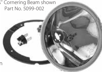
Cibié Oscar SC Driving Lamp "VA" Cornering Beam shown Part No. 5099-002

Note: An acrylic or polycarbonate fairing is highly recommended with these lamps to protect the lens from damage. Many racing organizations also require such a cover to contain any glass shards in the event of breakage.